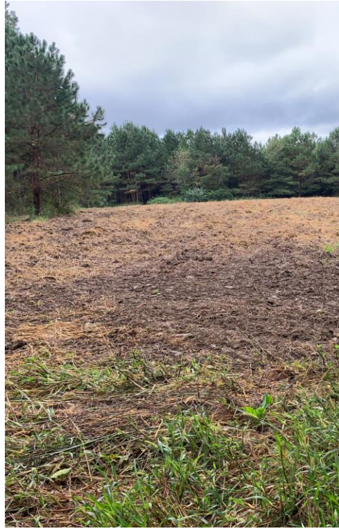
Wildlife Food Plot