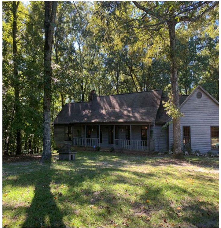
Perfect for Home or Hunting Lodge