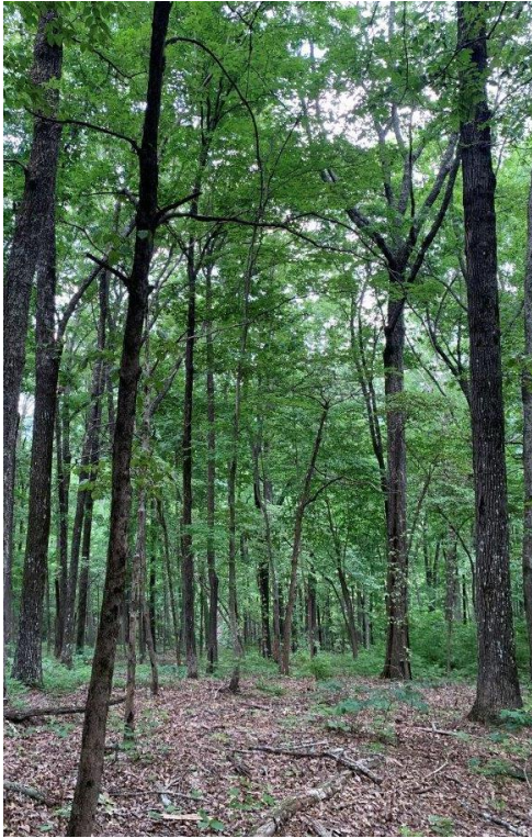
Mature Hardwood Timber