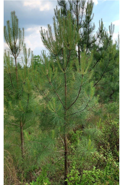
Young Timber Stand